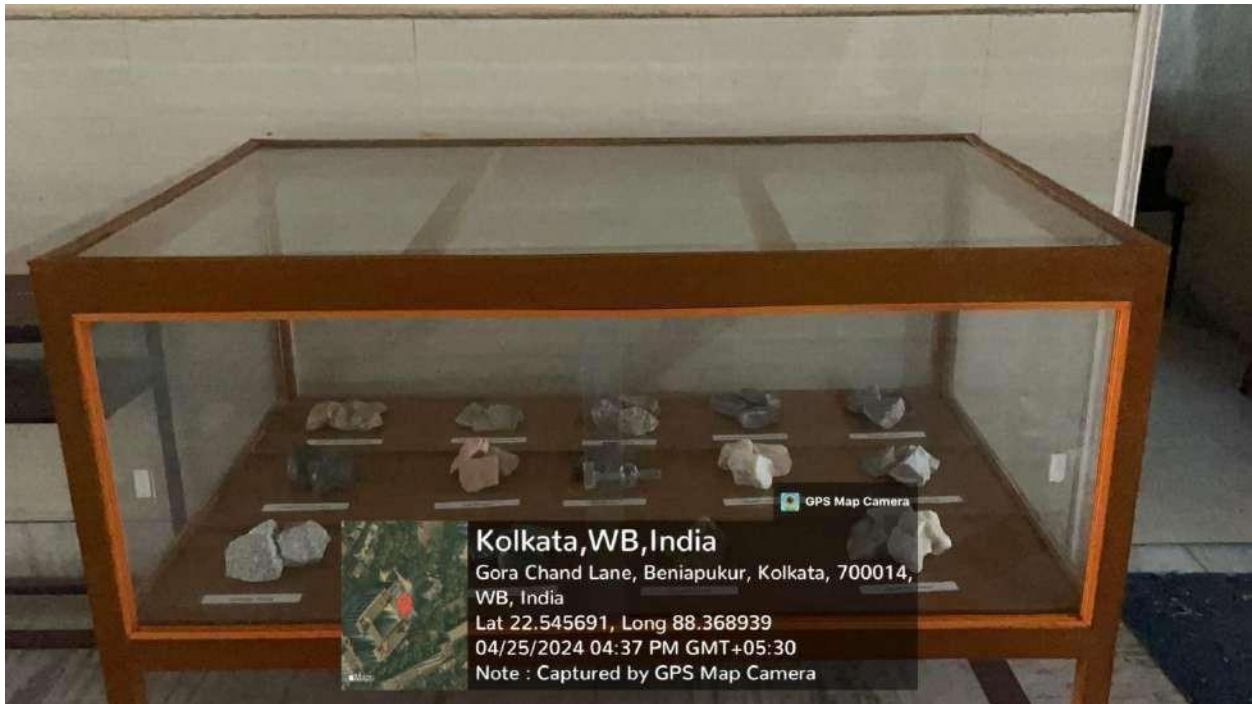
Figure 2: Rock Gallery