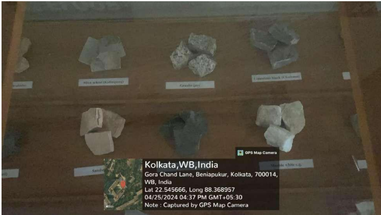
Figure 1: Rock Gallery display